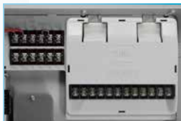
16-station configuration with (1) 12-station module