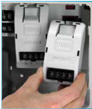
Modular configurations from 4 to 16 stations

Simple-to-use software allows you to program everything at a computer. Use a standard USB drive to transfer programming to one or more controllers in a matter of seconds. Create your own schedules or utilize the easy to use wizard to generate a schedule based on the historical requirements of your location.