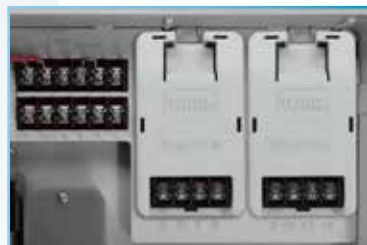
12-station configuration with (2) 4-station modules