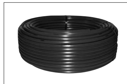
XF™ Dripline Coil