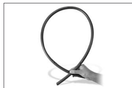
XF™ Dripline offers increased flexibility for easy installation.