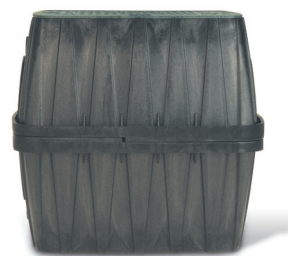
Interlocking Bottoms for Deep Installations

VB-MAX-H: Black body and green lid with 2 locking hex bolts