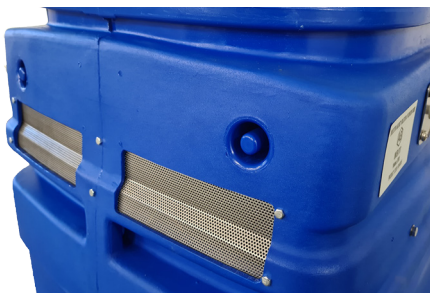
BACKFLOW PROTECTION Screened weir overflow with Category 5 Class AB air gap protection.