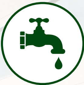
Sinks & Taps