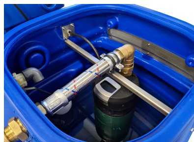
PLUG & PUMP Fully integrated system, inverter, sensors, non return valve, expansion vessel and isolation valve

DIMENSIONS Width 580mm Height 895mm Depth 747mm Weight 39 KG dry