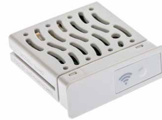
WAND Wi-Fi Module