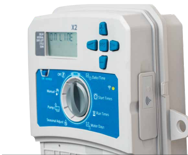
WAND Module installed in X2 controller