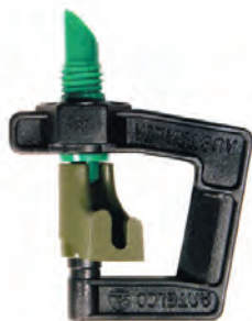
Inverted Rotor Spray™ 10-32 UNF Thread