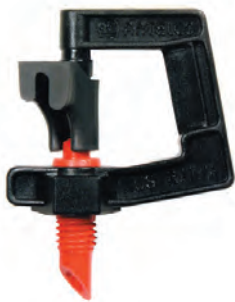
Rotor Spray™ 10-32 UNF Thread