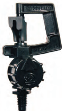
Vari-Rotor Spray™ 10-32 UNF Thread