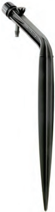
PotStream™ Adjustable Flow