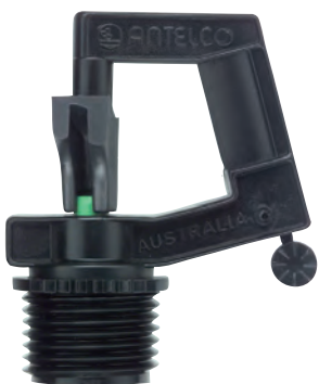
Rotor Rain® 1/2" Thread