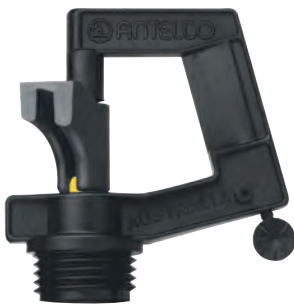
Rotor Rain® 3/8" Thread